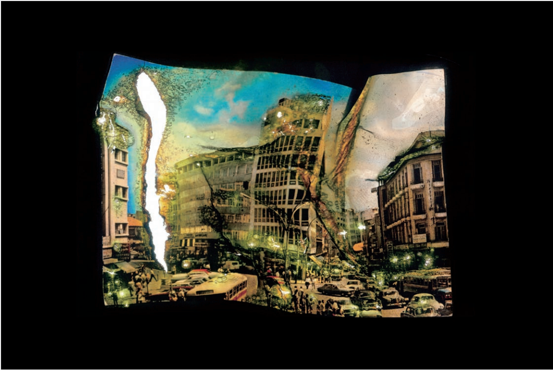
#6 (Rivoli Square)