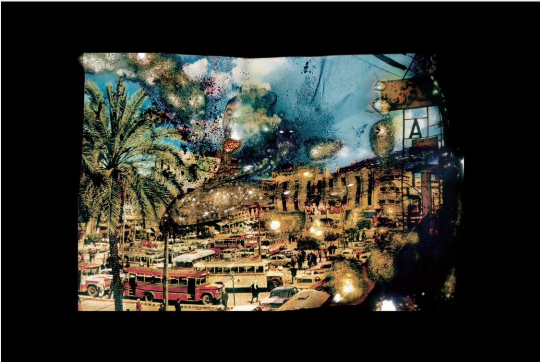
#15 (Rivoli Square)